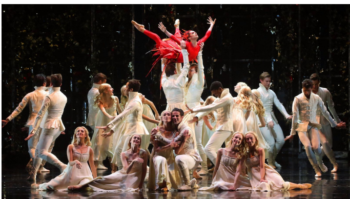
The firebird theme is played by the piccolo and soprano clarinet. The soprano clarinet is smaller than the standard clarinet which most instrument players begin with. It plays very high notes.